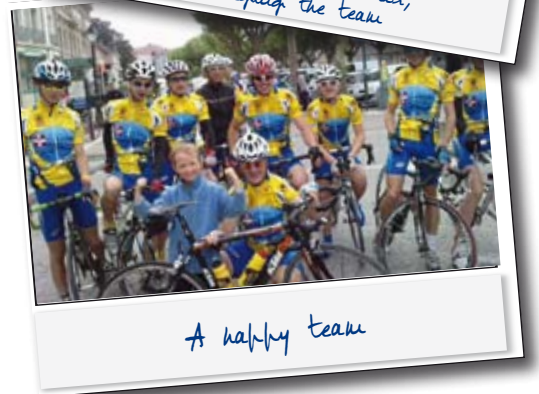
A happy team