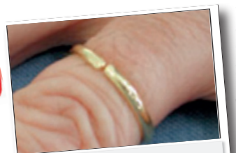
A weakened ring

Visiting our web site : www.carbone-savoie.fr