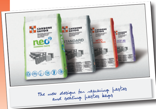
The new design for ramming pastes and sealing pastes bags