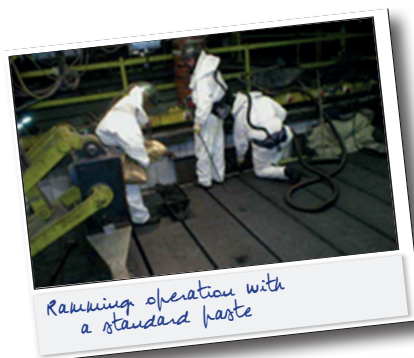
Ramming operation with a standard paste

From now on, all of you know NeO 2 well. This paste revolutionizes the working conditions during production and use. Through this performing and responsible product, Carbone Savoie is the only supplier in the world to guarantee a clean and safe environment for our customers and our people.