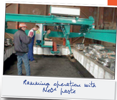
Ramming operation with NeO 2 paste