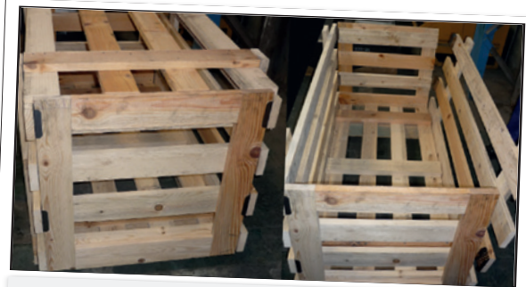
The new crate without nails to make easier the unpacking

This innovation has been made possible thanks to the involvement of Carbone Savoie staff and supplier.